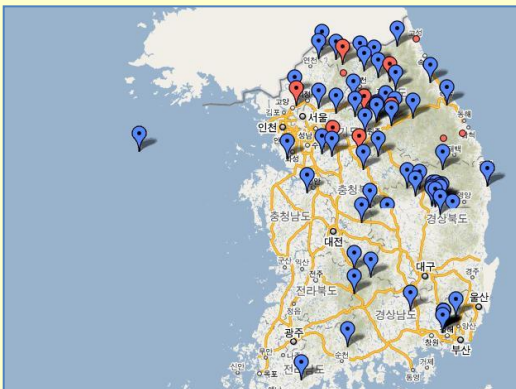
Map of burial sites for livestock in S Korea.

http://www.cfsph.iastate.edu/DiseaseInfo/disease.php?name=foot-and-mouth-disease&lang=en