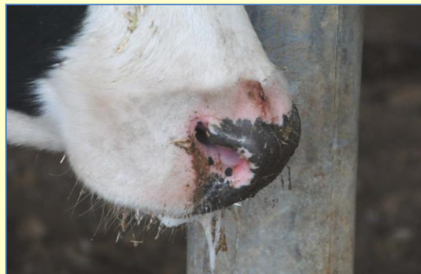
Dairy cow with FMD.